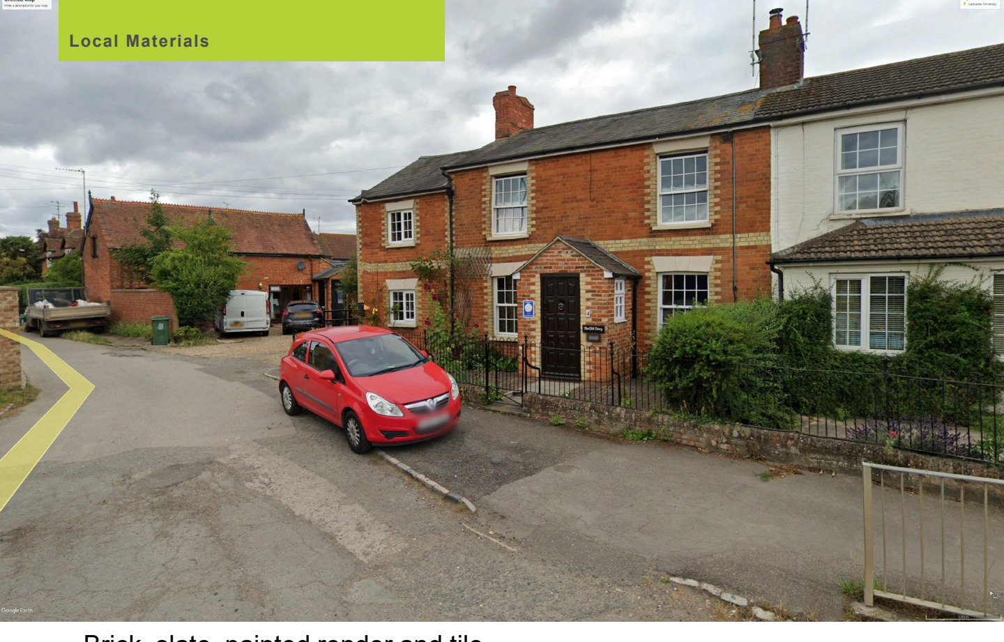
Brick, slate, painted render and tile