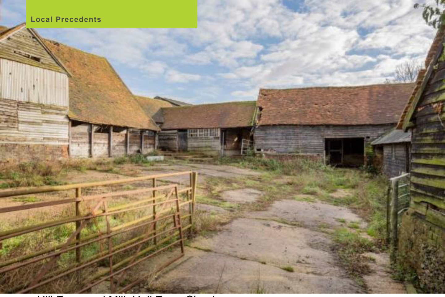
Hill Farm and Milk Hall Farm Chesham