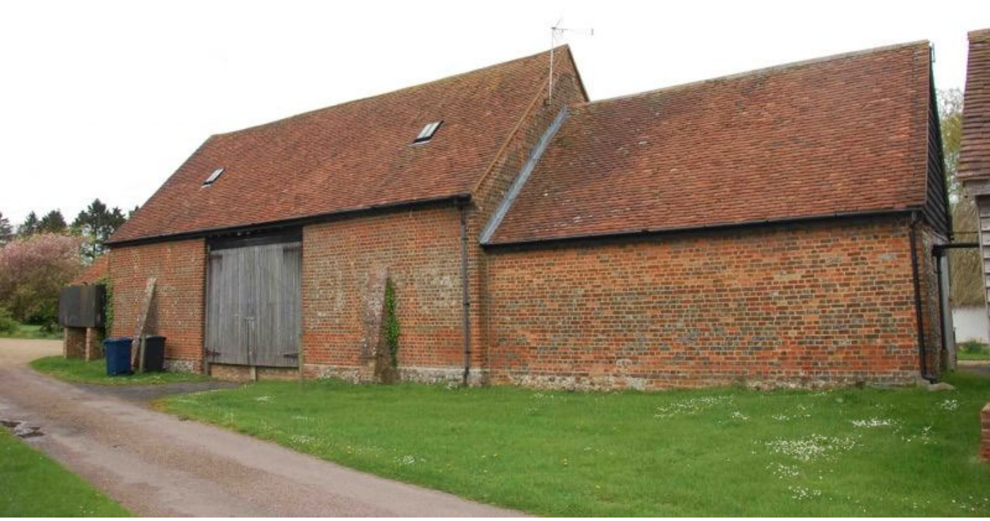
Barn at Studdridge Farm, Stokenchurch, Buckinghamshire