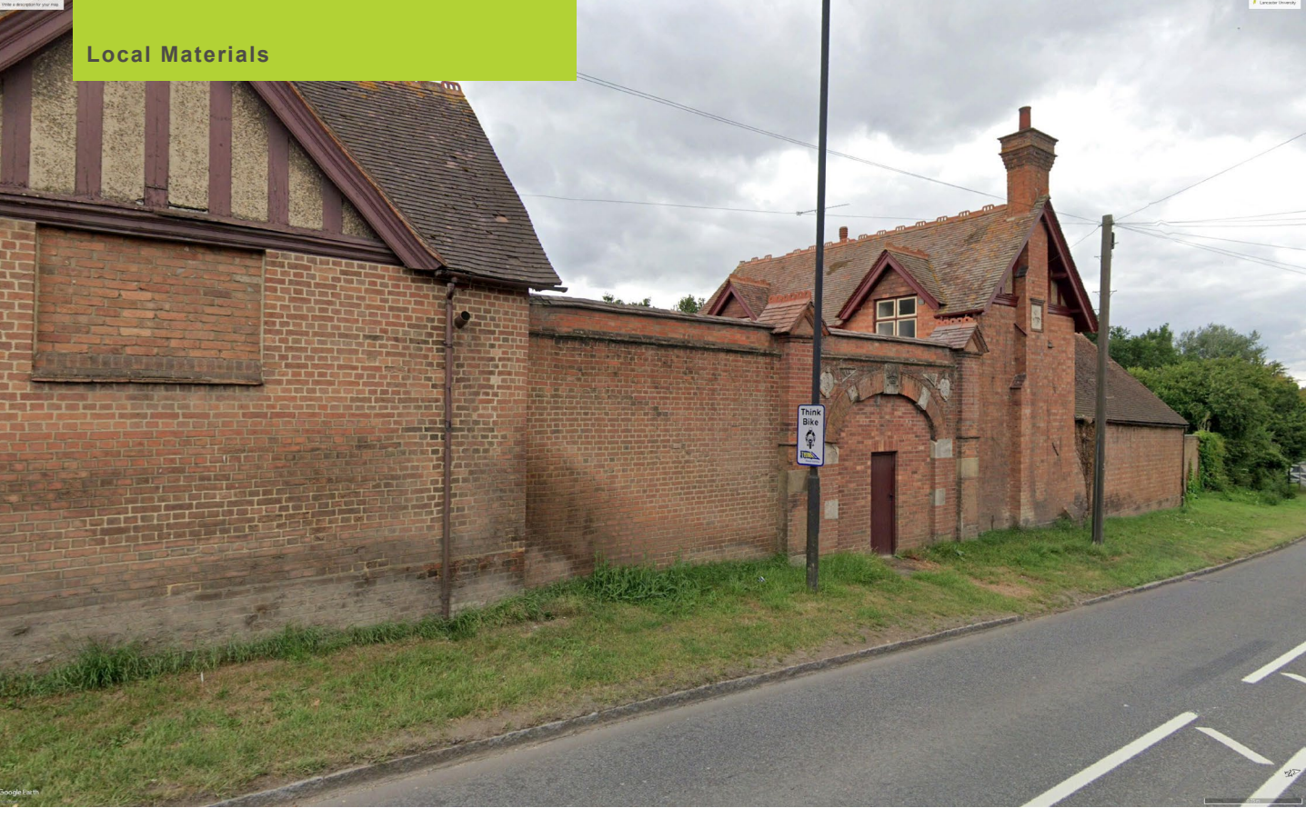
Brick and tile